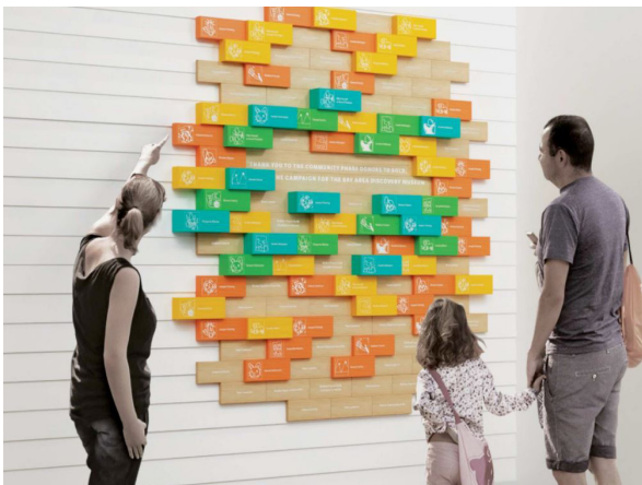
Example of a community donor wall.

Upon completion of the pool, a permanent community donor wall display will be installed in the pool's main lobby as a tribute to all donors of the Boissevain-Morton Aquatic Centre.